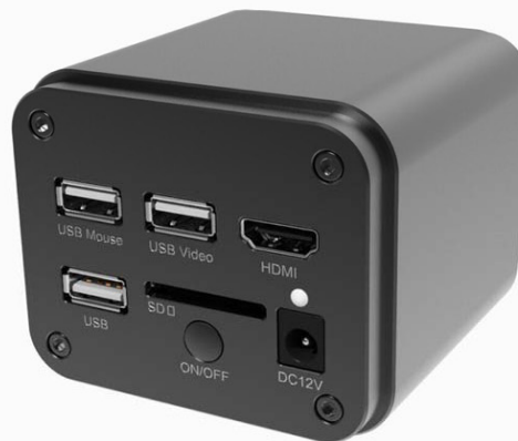
Dimension for XCAMLITE4K Series

Архангельск (8182)63-90-72 Астана (7172)727-132 Астрахань (8512)99-46-04 Барнаул (3852)73-04-60 Белгород (4722)40-23-64 Брянск (4832)59-03-52 Владивосток (423)249-28-31 Волгоград (844)278-03-48 Вологда (8172)26-41-59 Воронеж (473)204-51-73 Екатеринбург (343)384-55-89 Иваново (4932)77-34-06